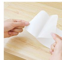
PEEL OFF THE PAPER