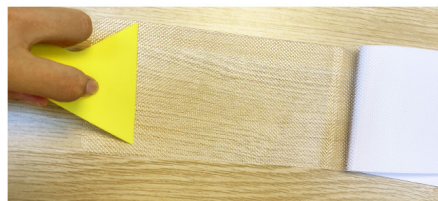
PASTE & GET RID OF BUBBLE INSIDE

1.PLEASE CLEAN THE FLAT SURFACE BY WET CLOTH, AND DRY.