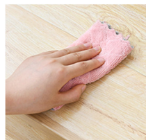
CLEAN THE SURFACE